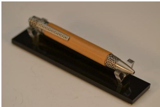
Grant Barlow, Columbia Coffee Tree