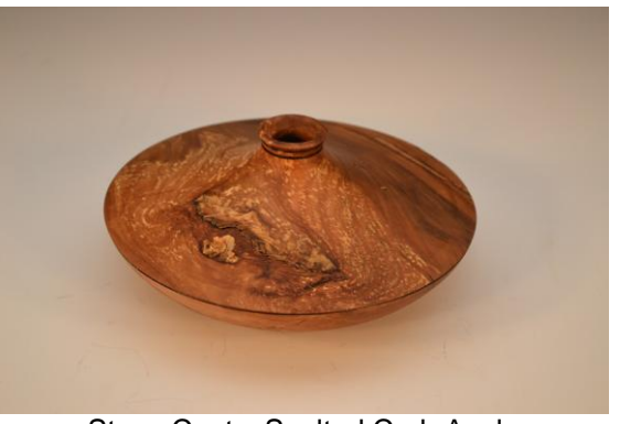
Steve Coats, Spalted Crab Apple