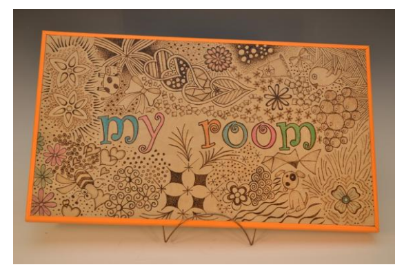
Joni Overhouse, Maple Veneer Plywood