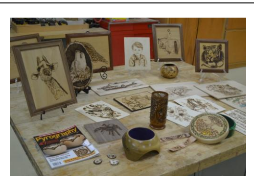
Demo (Stacy Nehl, Woodburning)