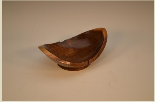
Jim Gabor, Walnut