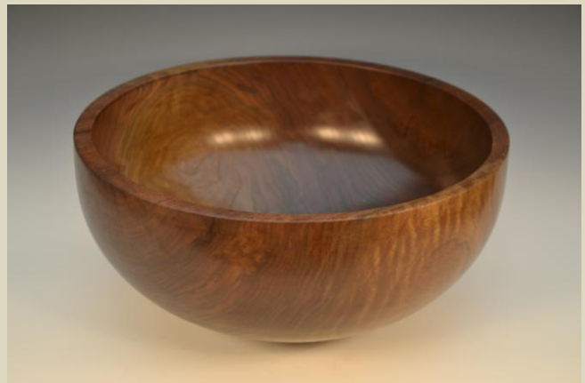
Ken Winge, Walnut