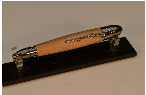
John Plkornik, 125 year old Maple form Savanah, Ill. Historic Sociey