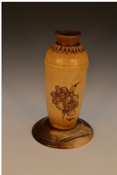
Mary Scanlan, Walnut with gourd seed necklace