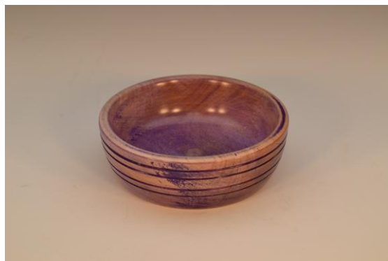
Maureen Seier, Hickory with purple stain